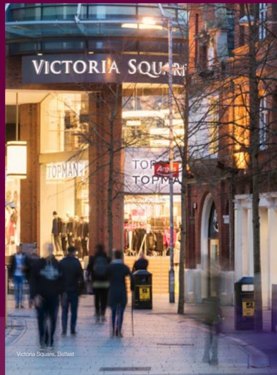
Victoria Square, Belfast