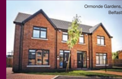
Ormonde Gardens, Belfast