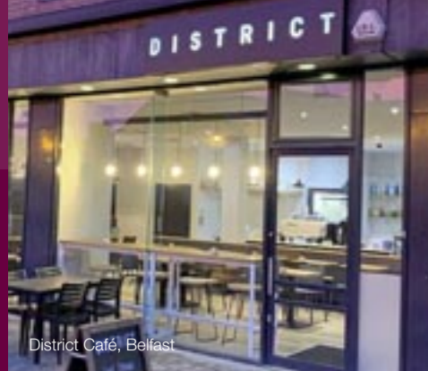
District Café, Belfast