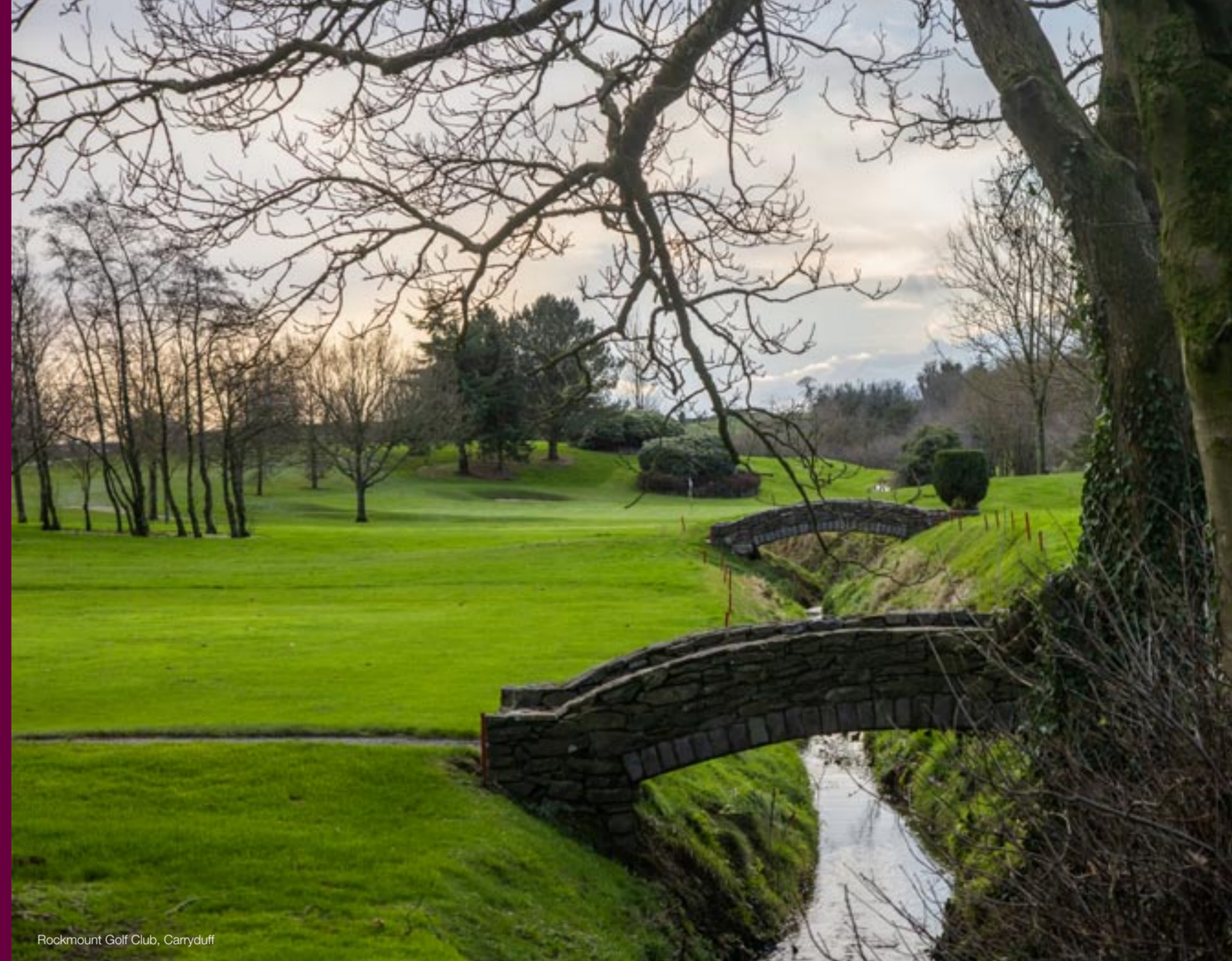
Rockmount Golf Club, Carryduff