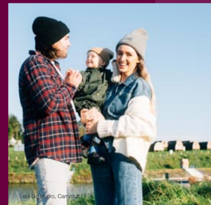
Lets Go Hydro, Carryduff