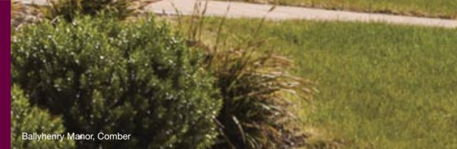
Ballyhenry Manor, Comber