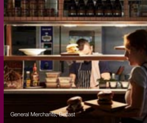
General Merchants, Belfast