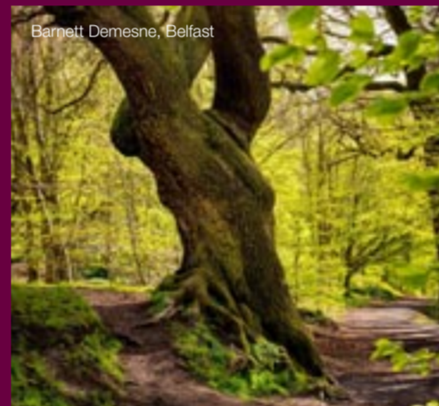
Barnett Demesne, Belfast