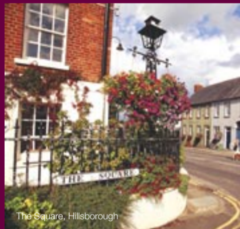
The Square, Hillsborough