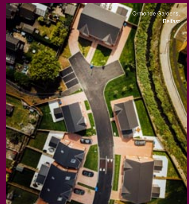
Ormonde Gardens, Belfast