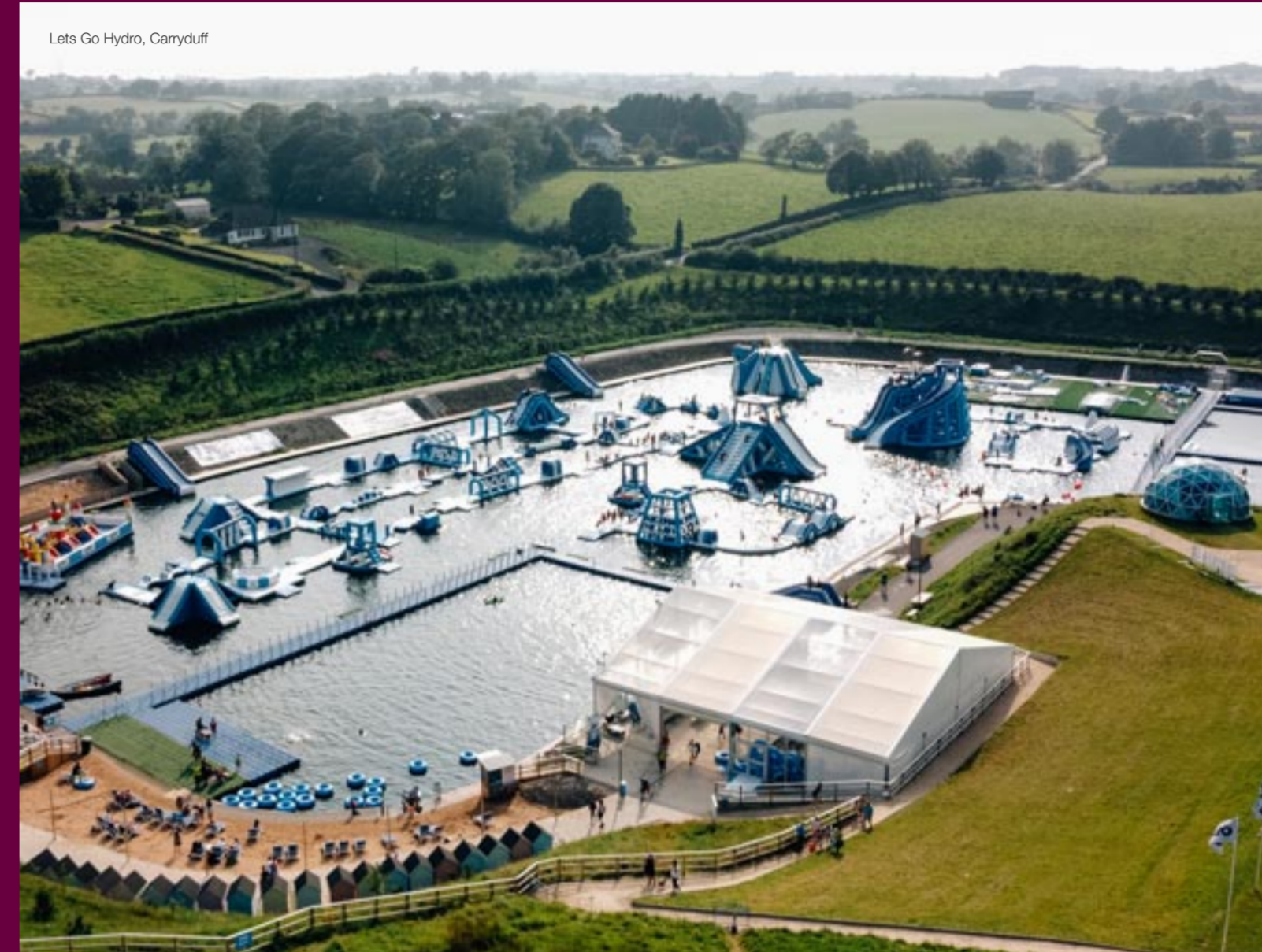
Lets Go Hydro, Carryduff