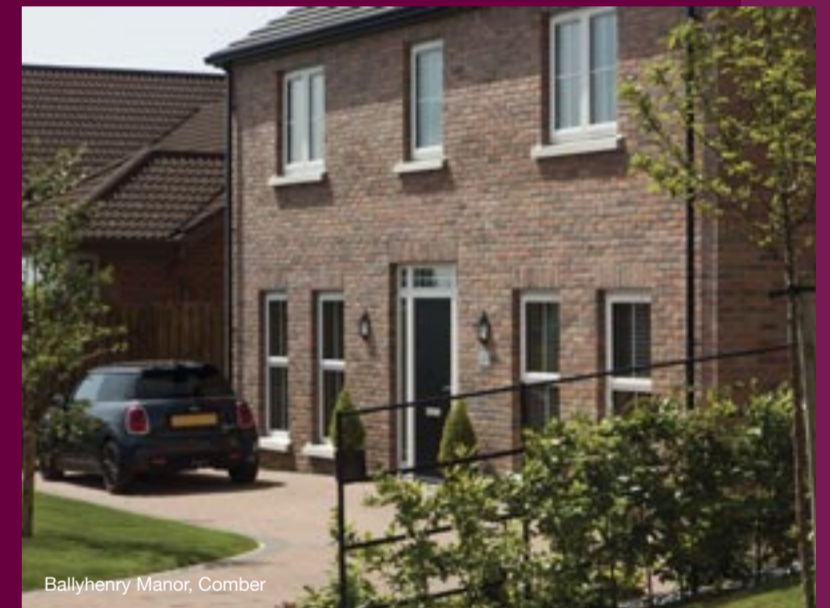
Ballyhenry Manor, Comber

Traditional designs, built to the highest standards, in key locations. We recognise that our customers are at the core of our business and therefore, pride ourselves on providing the highest levels of customer service. You will be proud to call your home a Rosemount Home.