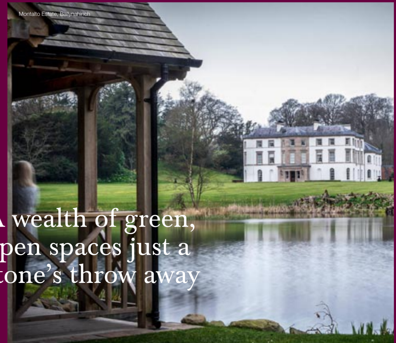
Montalto Estate, Ballynahinch

A number of fantastic local parks are positioned nearby, including Belvoir Forest Park, Barnett Demesne and the highly regarded Sir Thomas and Lady Dixon Park. What's more, thanks to the popular Forestside Shopping Centre situated just a short drive away, not forgetting the wealth of shopping opportunities available at Belfast's City Centre, homeowners can experience the very best in local retail facilities.