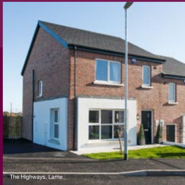
The Highways, Larne