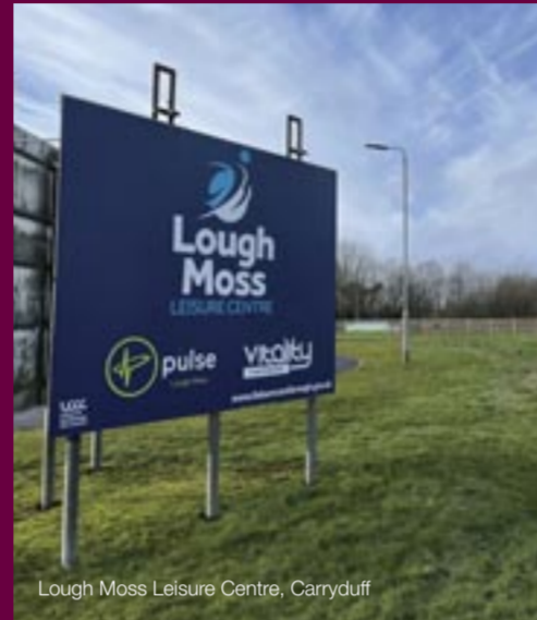
Lough Moss Leisure Centre, Carryduff