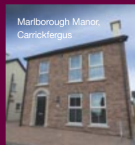
Marlborough Manor, Carrickfergus

We pride ourselves on our company values; Trust, Respect, Caring, Being Open, and Honest.