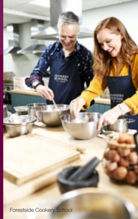
Forestside Cookery School