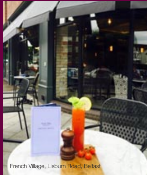
French Village, Lisburn Road, Belfast