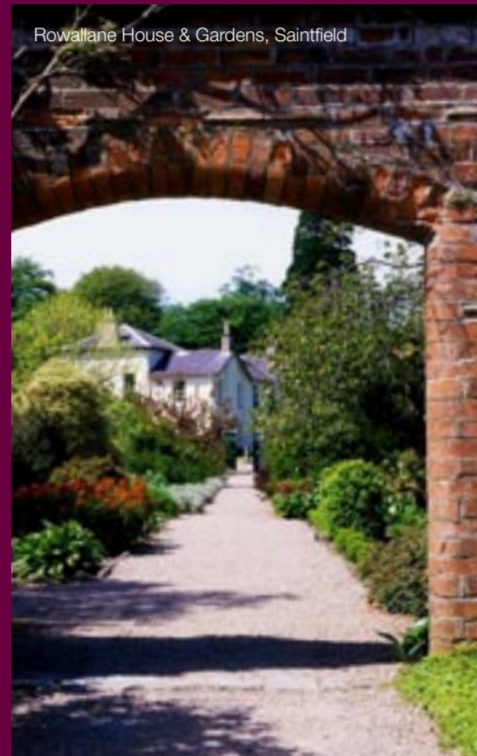
Rowallane House & Gardens, Saintfield