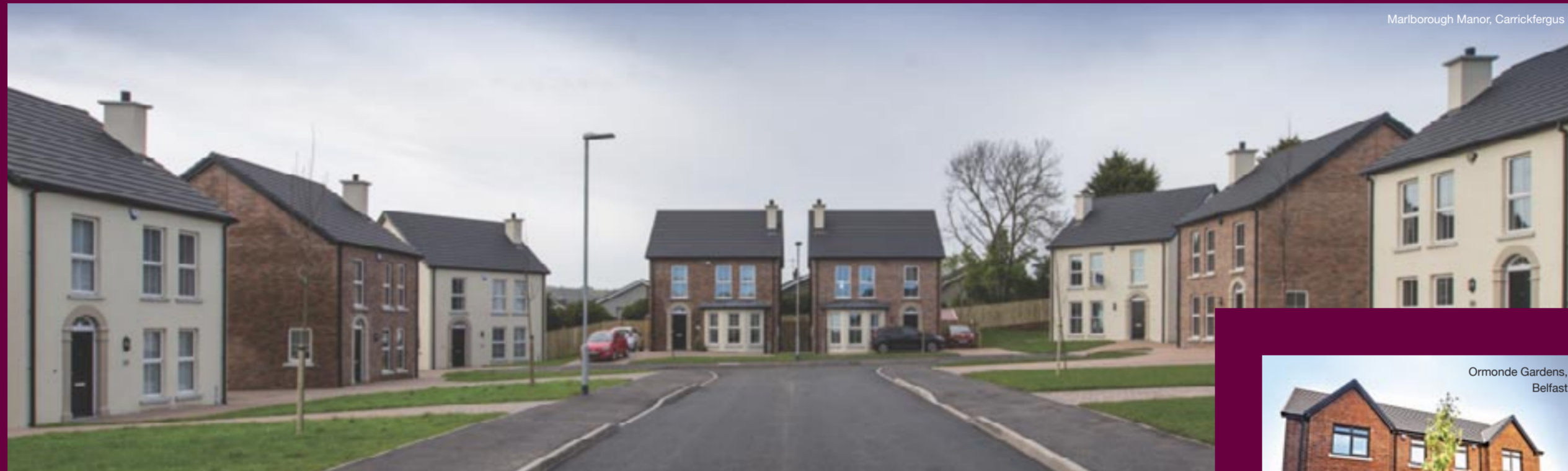
Marlborough Manor, Carrickfergus